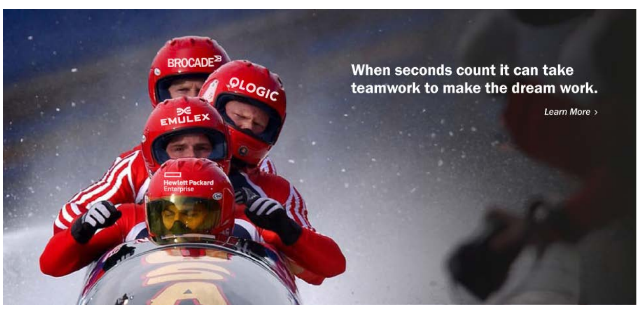
Maximizing the Potential of All-flash Storage with HPE StoreFabric Gen 5 16GFC

The computing industry is experiencing increasing demand for storage performance, including greater bandwidth and IOPS along with reduced latency due to demands for increased application performance and continual growth. Emulex had us test their 16GFC and 8GFC adapters in an Oracle database data warehousing environment with Cisco serves and switches. Learn about the results by clicking the link above.