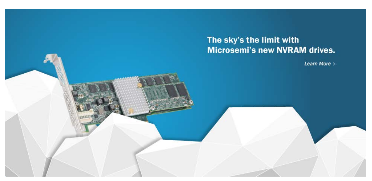
Improving Database Performance with Microsemi NVRAM Drives

Microsemi recently commissioned Demartek to evaluate the Flashtec NV1616 NVRAM PCIe card as a log device for an Oracle database executing a write-heavy OLTP workload. Performance, measured by the average number of database transactions per minute, with redo logos deployed on SATA SSDs was compared with logging to Flashtec NVRAM. Get all the details by reading our full report.